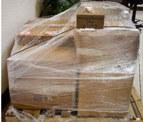
Pathway to Education bricks

The pallet of bricks purchased as part of our Pathway to Education fundraising efforts has arrived. We will be working with the physical plant to discuss design and installation plans for the bricks in the upcoming months.