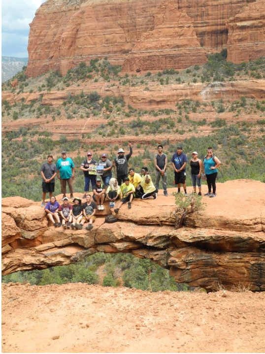
TRIO and Lobo Academy students on Devil's Bridge near Sedona, Arizona.