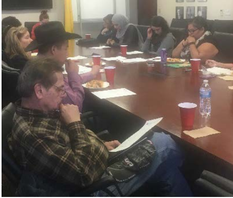
Student Senate Meeting